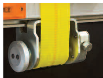
The hand-wheel takes up the slack and the gear-drive EZ Torque Winch does all the work of tensioning a strap.

"The EZ Torque, Winch is from Ancra. So I know I can depend upon it."